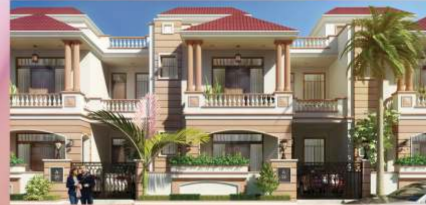
Running Project - Shagun Royal

Project By OWAIS OWAIS CONSTRUCTION COMPANY Pvt. Ltd.