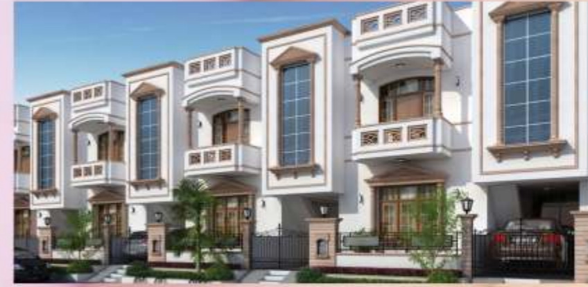
Previous Project - Shagun Villa