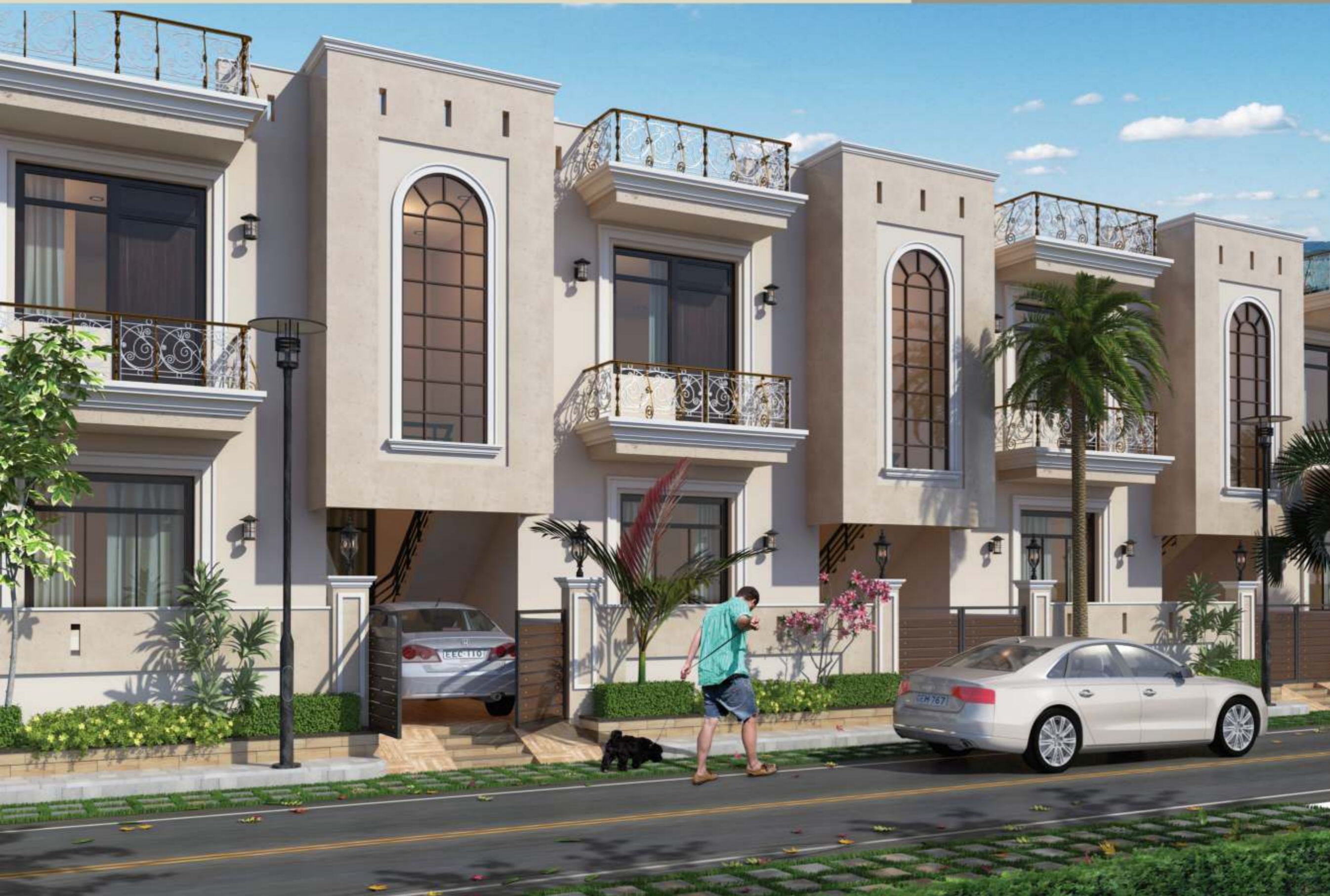
Semi Duplex Villa