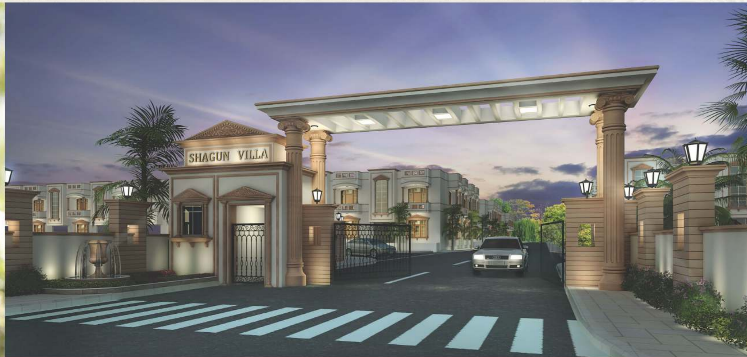
Elegant night view of Shagun Villa